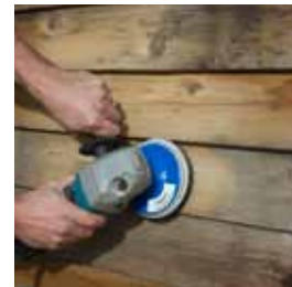
Buffy Pad System