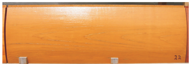
Two of the same color coats, plus Advance Gloss Topcoat