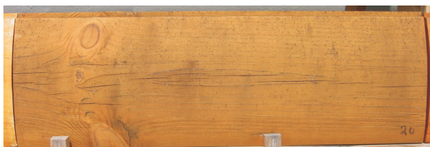
Two color coats, no topcoat