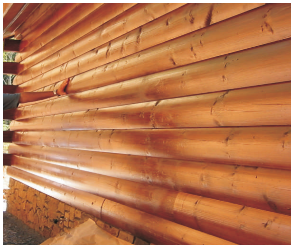
One of the first homes topcoated with Advance Gloss.

These are some of the reasons why LIFELINE Advance Topcoats play a key role in the performance of all of our exterior finish systems.