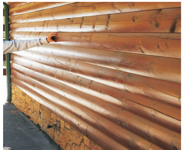
The same wall 5 years and 4 months later. No maintenance had been performed on the exterior finish during the intervening years.