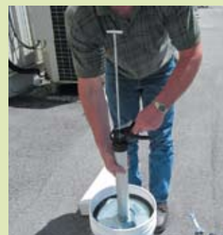
Ensure the tight seal, fully extend rod and fill the barrel. Disengage from the follow plate