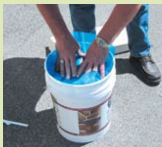
Replace plastic liner over the surface of the sealant