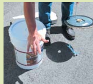
Replace the lid. Make sure that it is tight on the pail