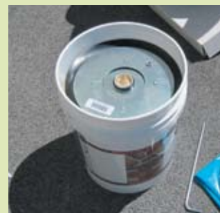
Place the follow plate on top of the chinking pail