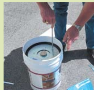
Insert the handle rod into the open nut to remove the follow plate