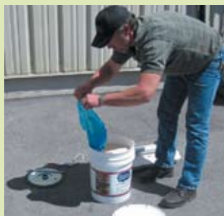
Remove the lid and the plastic liner from the pail