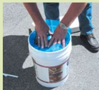
Replace plastic liner over the surface of the sealant