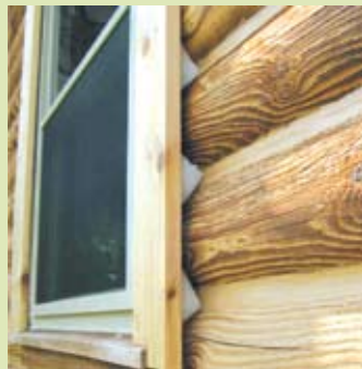
Insert foam blocks into void between logs and frame. Leave 3/8" gap between surface of foam and edge of frame