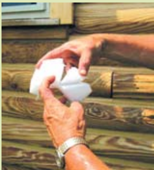
Cut triangular blocks of EPS or polyethylene foam