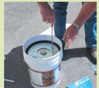
Insert the handle rod into the open nut to remove the follow plate