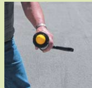
Attach the end cap and cone tip to the end of the barrel