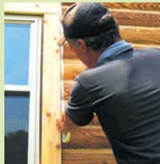
Apply masking tape to prevent sealant from smearing onto the adjacent logs