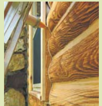
Fill the 3/8" gap between the surface of the foam and the edge of the frame with sealant