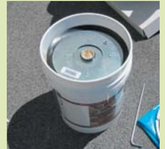
Place the follow plate on top of the chinking pail