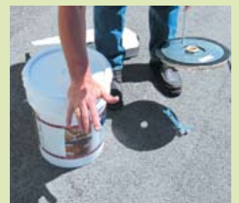
Replace the lid. Make sure that it is tight on the pail