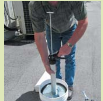
Ensure the tight seal, fully extend rod and fill the barrel. Disengage from the follow plate