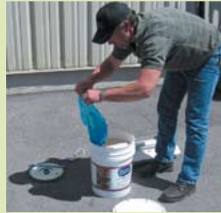
Remove the lid and the plastic liner from the pail