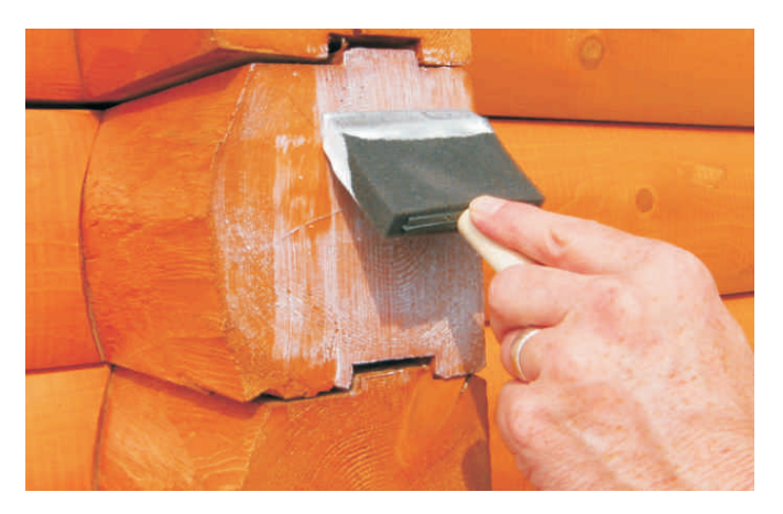
Applying Log End Seal

When applied correctly one gallon of Log End Seal goes a long way. One gallon covers 30 to 40 square feet which equates to 100 eight inch diameter log ends or 180 six inch diameter log ends.