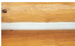
Log Jam holds its seal.

Log Jam is still the only chinking to hold a UL fire resistance rating. Log Jam stretches and compresses as logs shrink and swell—up to 100% of the original joint size (+/- 50%). Yet it maintains the traditional look of mortar, without “stretching out,” so it still looks good after years of log movement. And Log Jam sticks! When other chinking products pull away from logs, leaving your home vulnerable to weather, air infiltration and insects, Log Jam is still maintaining a tight seal.